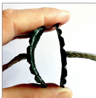
LOOP® Flexi Stickon's can be bent to a 20 mm radius