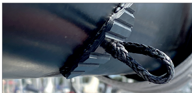
LOOP® Flexi Stickon glued to the curved surface of a boom