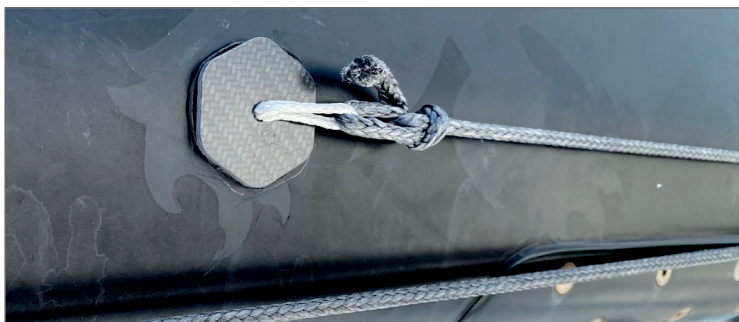
LOOP® Stickon used for a lazyjack system

These stickon padeyes are now available with a 40-60 mm flat carbon disk. Their strength is reliant on a good bond between the disk and the hull, deck or bulkhead surface and this is where they run into problems, i.e. trying to find flat spots in confined spaces.